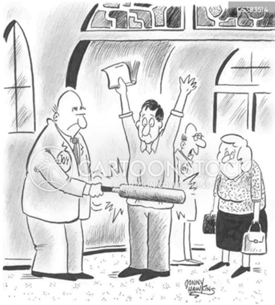
"He's checkin' for cell phones."