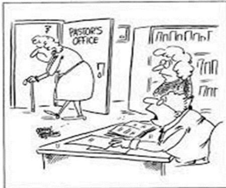
"She never tithes, but she always gives her two cents' worth."