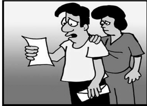
"Its from our church... we've been called up for active duty."