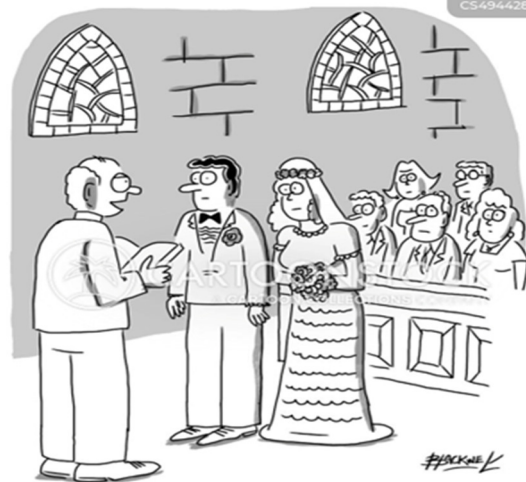
"IF ANYONE HAS GOOGLED REASONS THAT THESE TWO SHOULD NOT BE MARRIED..."