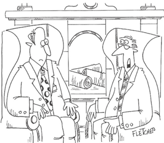
"Yes, I would say mine is a giving church. They give me advice. They give ultimatums. They give me ulcers."