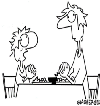
"If God wants me to be thankful for vegetables, why did He make them taste like vegetables?"