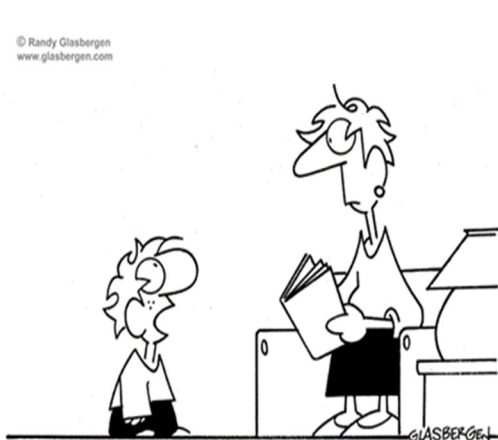
"Our pastor says all men are brothers. Does that mean all men want to pull my underwear up over my head?"