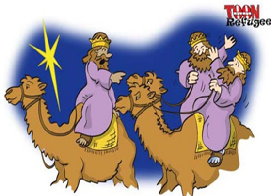
You two quit it or I'm turning this caravan right around!