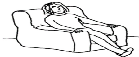
WHERE POSSIBLE I AM PLANNING TO DO THIS FROM THE COMFORT OF MY ARMCHAIR