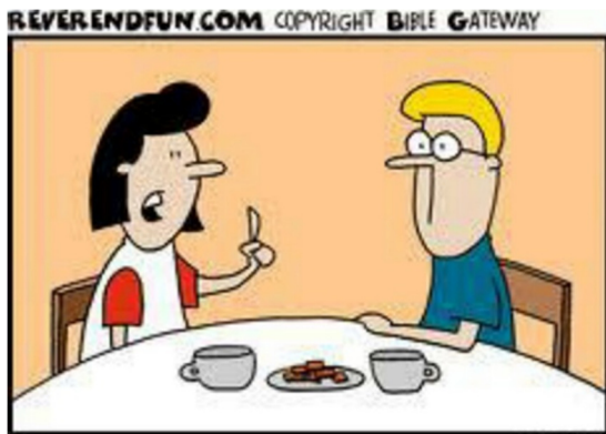
THIS YEAR, FOR NEW YEARS, I AM RESOLVING TO DO ALL SORTS OF BAD THINGS SINCE I NEVER EVER STICK TO MY NEW YEAR'S RESOLUTIONS