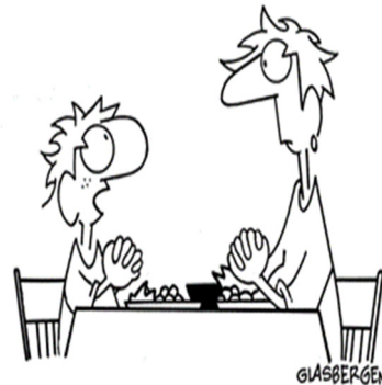
"If God wants me to be thankful for vegetables, why did He make them taste like vegetables?"