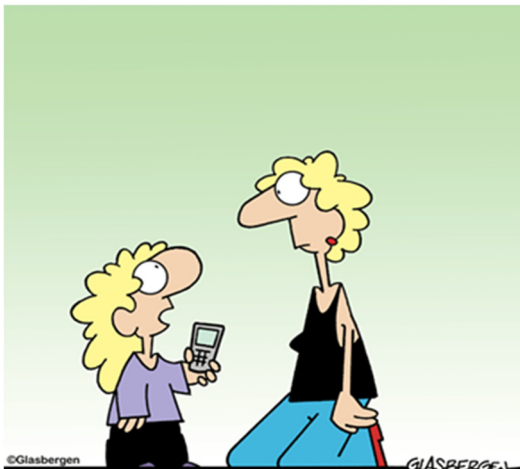
"If I send my prayer as a text message, will I get a faster reply?"