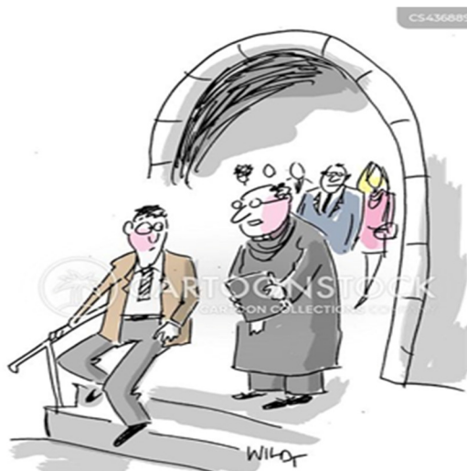
"Since you can't attend every Sunday, couldn't you at least like us on Facebook?"