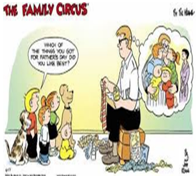
© 1977 THE FAMILY CIRCUS BY SCHWAN