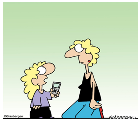
"If I send my prayer as a text message, will I get a faster reply?"