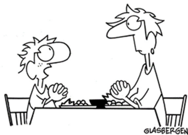
"If God wants me to be thankful for vegetables, why did He make them taste like vegetables?"