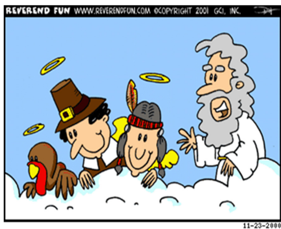
NICE WORK FELLAS ... IT'S BEEN A LONG WHILE NOW AND THEY ARE STILL REMEMBERING TO THANK ME